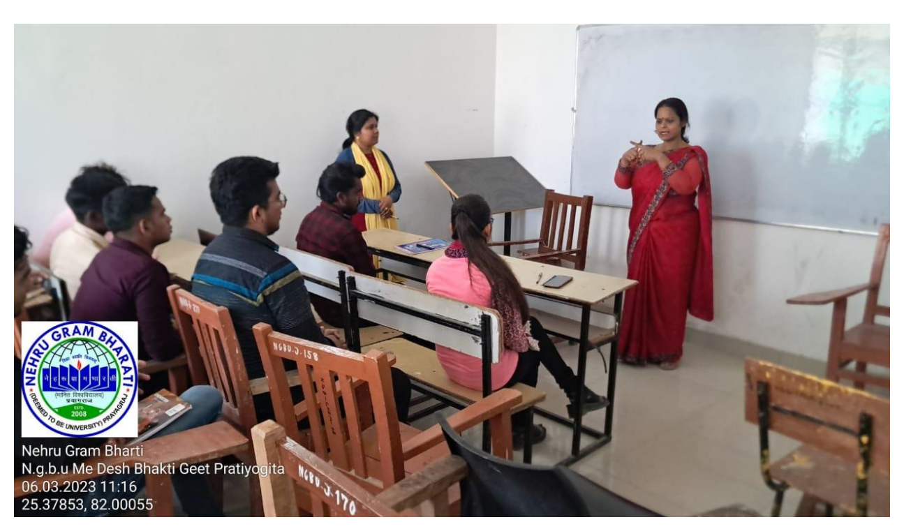
Sign Langauge Training Session under Talking Hands Programme