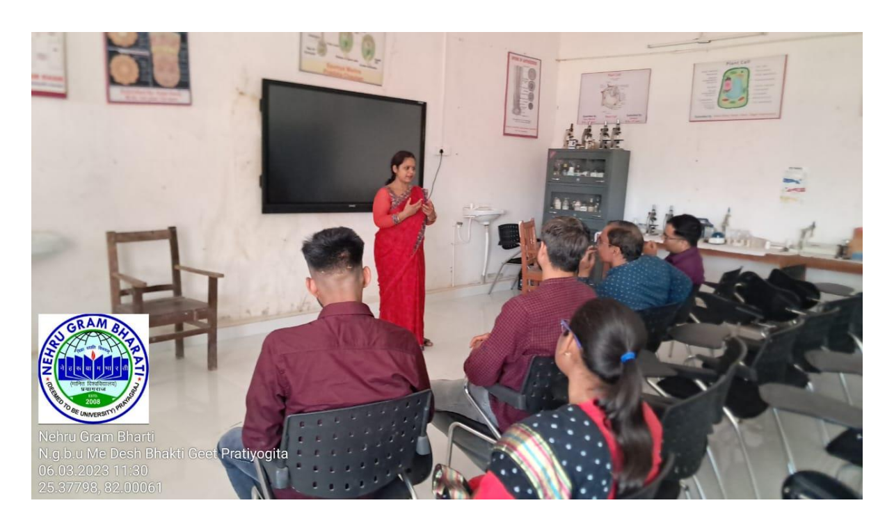
Sign Langauge Training Session under Talking Hands Programme