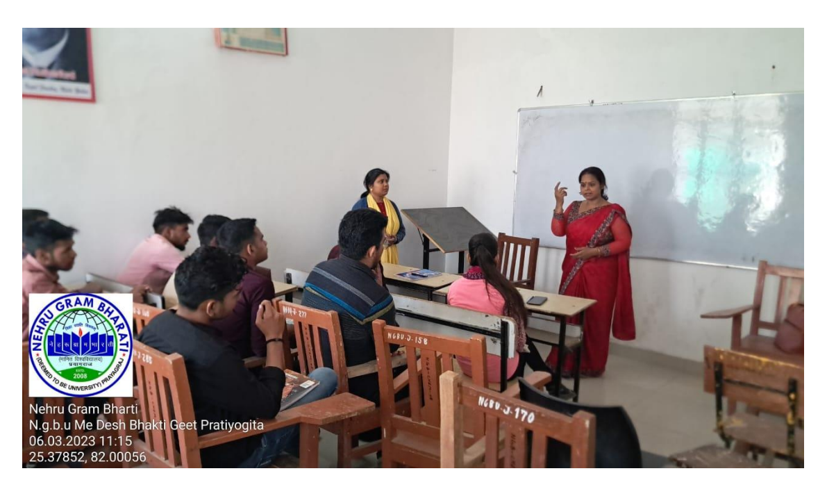
Sign Langauge Training Session under Talking Hands Programme